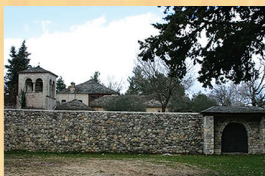
The Monastery of Prophet Elias, Zitsa