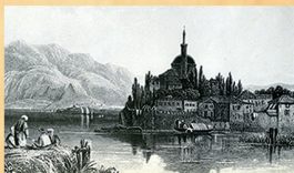
View of Ioannina