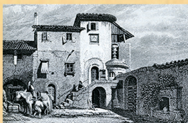
The Monastery of the Capuchins